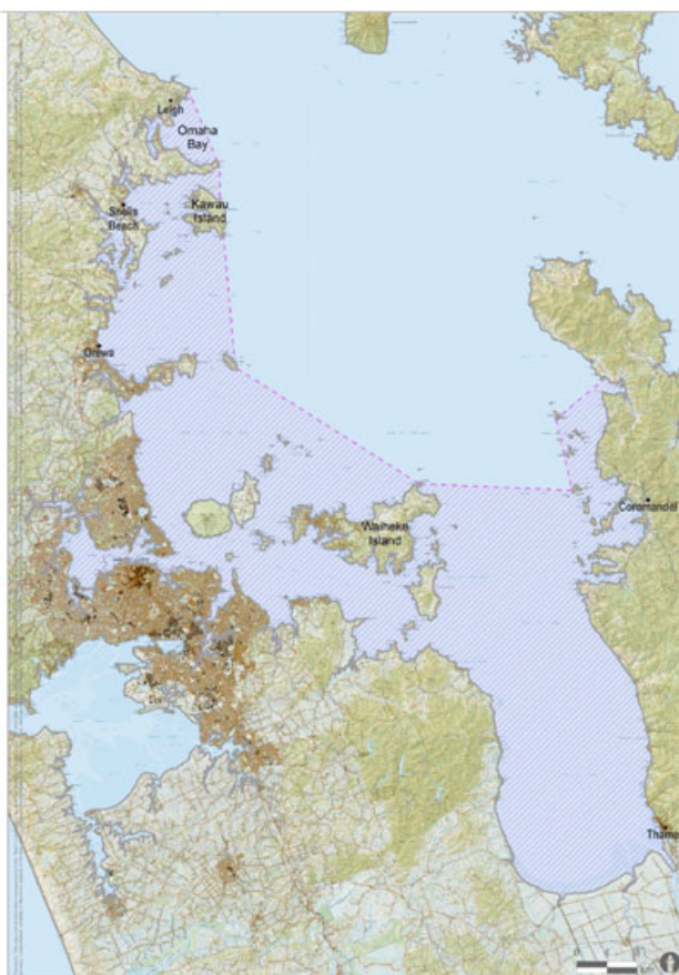
Figure 1: Proposed Hauraki Gulf Recreational Fishing Park boundaries.